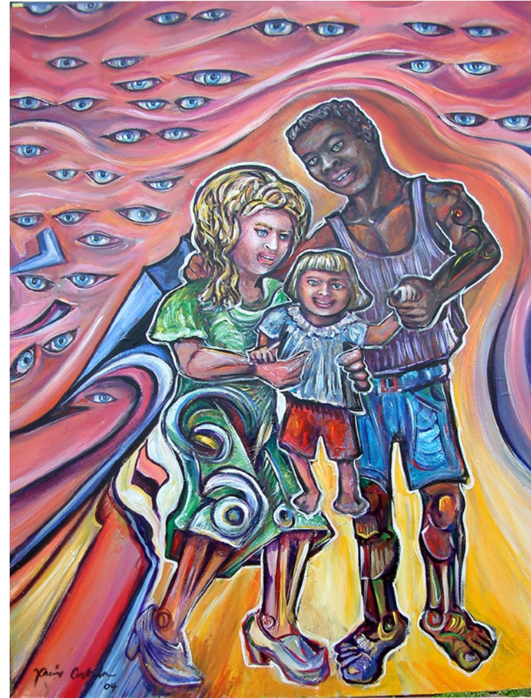
Xavier Cortada, "Palmore v. Sidoti," acrylic on canvas, 48" x 36", 2004